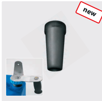
ST-83 adapter for 5 - 30 liter canisters. Incl. 0.5 m clear PVC hose for suction of chemicals, DN 4