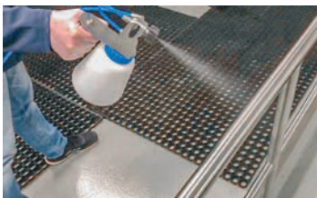
Partial cleaning: Also used as a handheld device, contaminated surfaces can be easily reached with the cold mist.