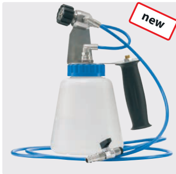
Disinfection cold fog air device ST-83. For compressed air connection 3 bar, 180-220 l / min. Stainless steel / plastic