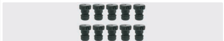
Plastic. 10 nozzle inserts (0.5 - 2.0 mm). Incl. o-rings